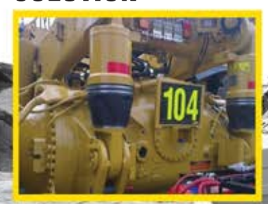
Mine Signs Spec